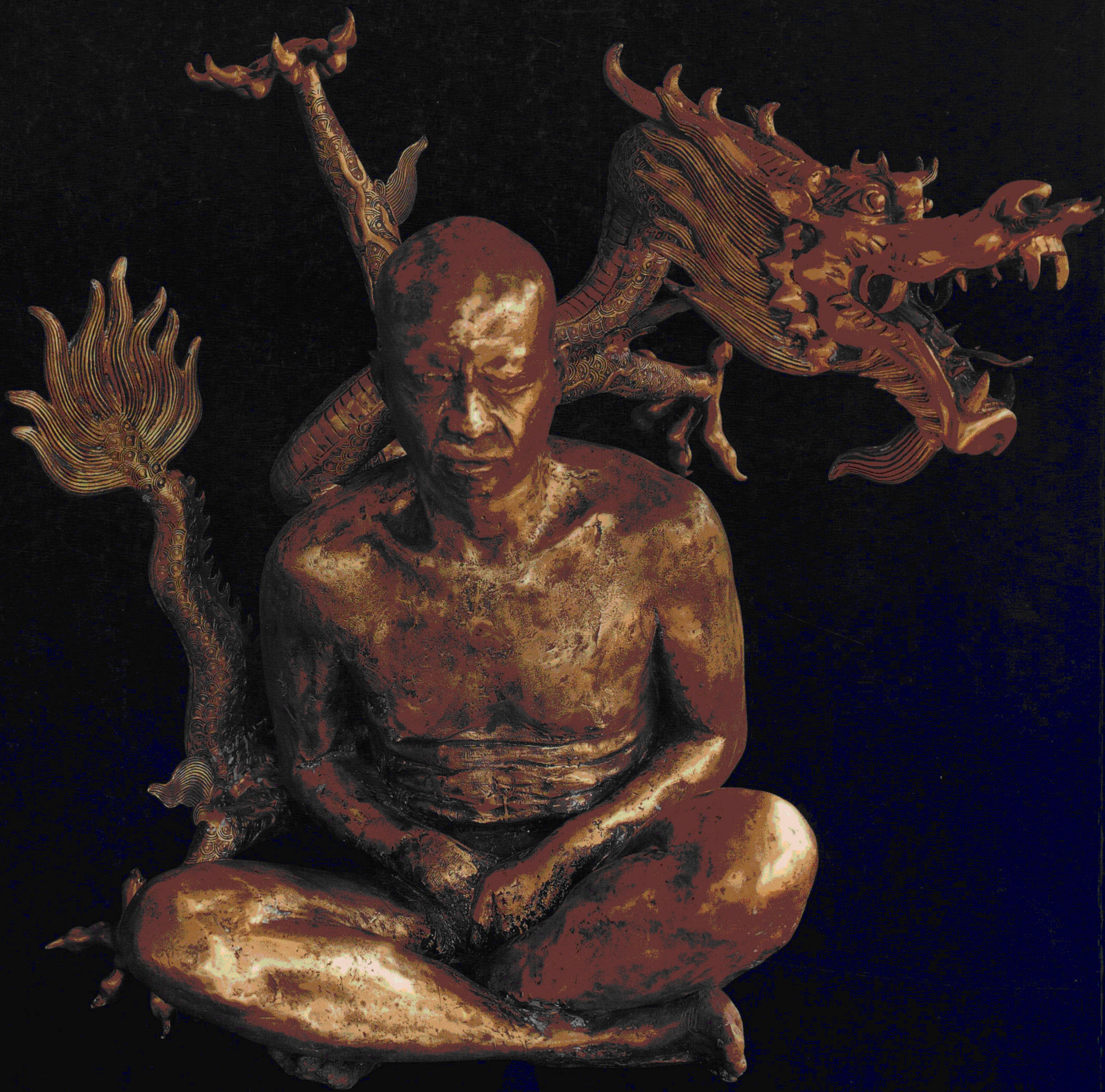
冥想thinker 100X90X95cm 铜 2007年 张大力