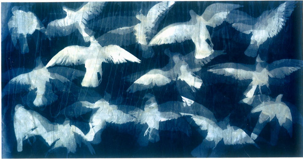
K6. 飞翔的鸽子 K6. Flying Pigeons 宣纸蓝晒 Cyanotype Photogram Mounted on Rice Paper 94.7 × 176.7cm 2013