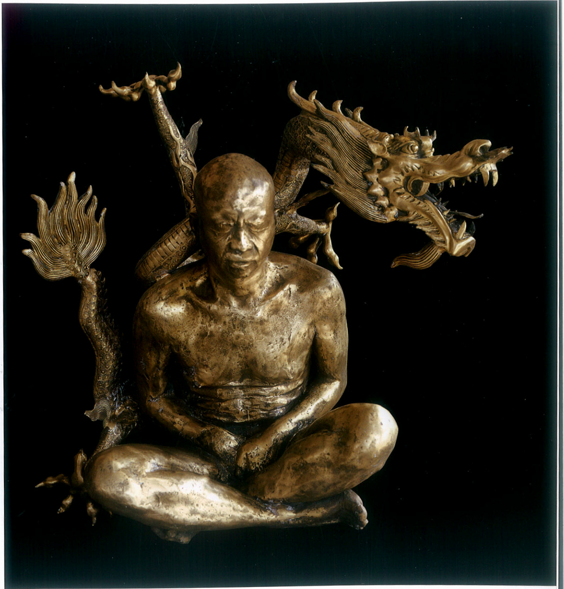
冥想 The Thinker 铜 bronze 100 × 90 × 95cm 2007