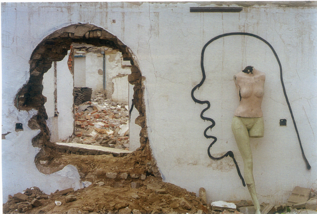
張大力 / 《對話與拆 199968A》 / 100 × 150cm / 1999 年 Zhang Dali / Dialogue and Demolition 199968A / 100 × 150cm / 1999

Name: From Reality to Extreme Reality - The Road of Zhang Dali Period: 2015/09/18-2016/03/18 Venue: The Wuhan United Museum Curator: Lu Hong Artist: Zhang Dali