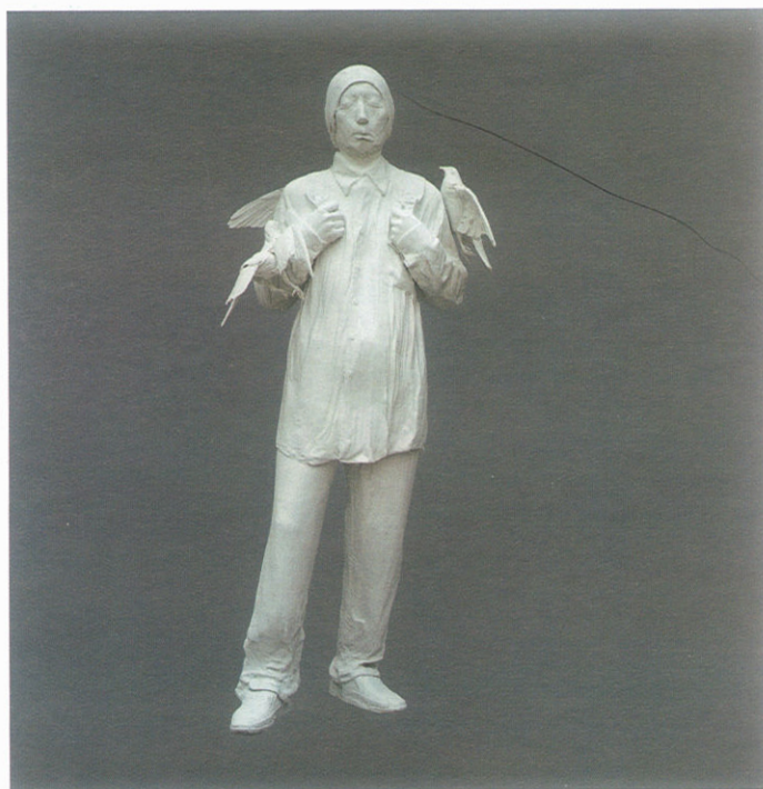
張大力 / 《廣場4》 / 玻璃鋼 / 173 × 95 × 80cm / 2014 年 Zhang Dali / Square4 / Resin / 173 × 95 × 80cm / 2014