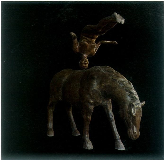
張大力 / 《馬上飛》 / 銅 / 235 × 60 × 218cm / 2007 年 Zhang Dali / Flying on a Horse / Bronze / 235 × 60 × 218cm / 2007

The Wuhan United Museum presents the 1st major solo museum exhibition in China of artist Zhang Dali's work. Spanning the artist's influential thirty-year career, the solo exhibition "From Reality to Extreme Reality: The Road of Zhang Dali", is curated by art critic Lu Hong, and is displayed at Wuhan's United Museum from September 18, 2015 to March 18, 2016.