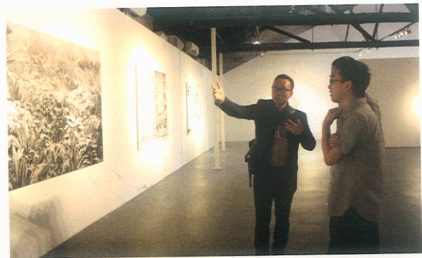
展览现场 Exhibition Site