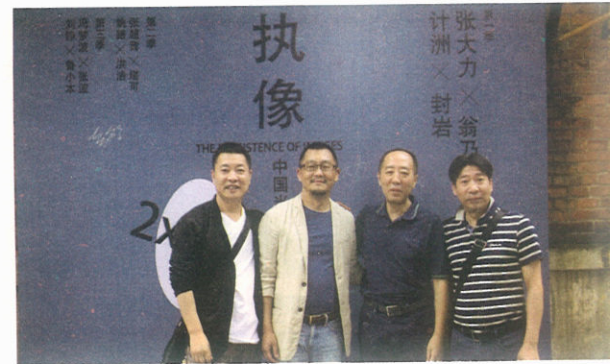
嘉宾合照 Group Photo of Guests