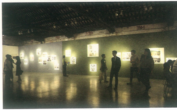
展览现场 Exhibition Site