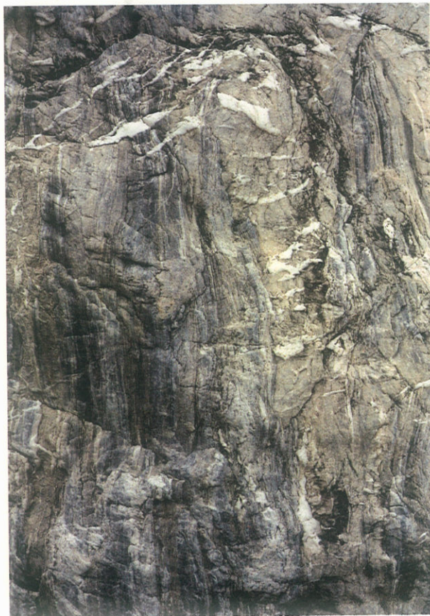
封岩, 山石 04, 120x180cm, 2011 Feng Yan, Rock04, 120x180cm, 2011