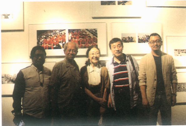
嘉宾合照 Group Photo of Guests