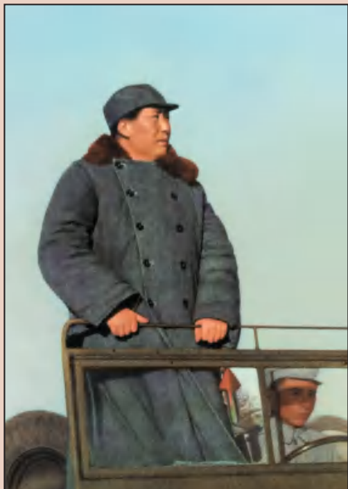
Zhang Dali A Second History 2022 Aluminum dibond artist prints