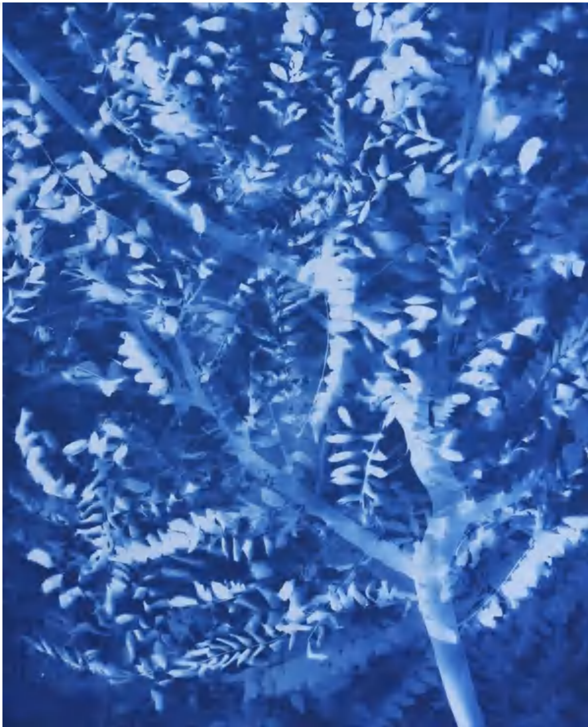
Herbarium Blue Crabapple ( M. spectabilis) (11), 2020, blue cyanotype on cotton, 225×160cm.