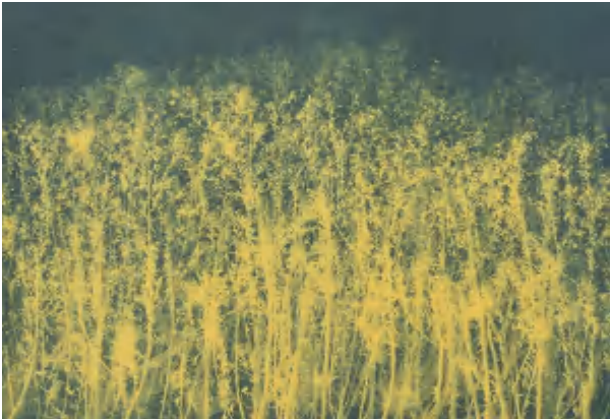
Zhang Dali, Herbarium Canadian Horseweed ( C. canadensis ) (1), 2020, yellow cyanotype on cotton, 135×190cm.

to convey the complex state of the city and its inhabitants, the reasons why they are formed, and the relationship that comprises them. Before focusing on residents' thoughts and states, he used demolished buildings in the urban system to analyze the change in the surface of the city. In response to the real-world scenario, Zhang expanded his research gear to include the city's wild plants in the cyanotype series, showcasing his thoughts on the rural-urban fringe's landscape. Unlike other types of landscape, this one is home to a variety of uncategorized and undesirable wild plants. Botanists and locals will most likely assign them a scientific name and an alias. Regardless of the name, but, they are the outcome of human observation and the replication of man's imagined rights, which in turn impose restrictions.