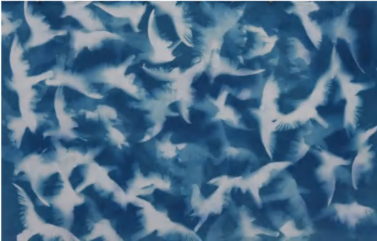
Dove (53), 2021, blue cyanotype on cotton, 145×230cm. Courtesy of the artist and Eli Klein Gallery