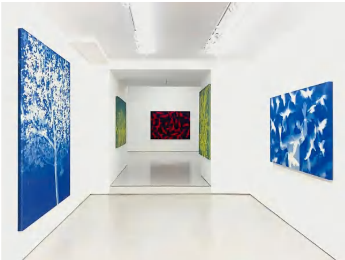
Installation view, Zhang Dali-Suffocation at Eli Klein Gallery.

The cyanotype series by Chinese artist Zhang Dali, which was on display at Eli Klein Gallery from May 19 to August 19, 2023, features six primary images: a man, doves, crabapple, pagoda tree, foxtail, and horseweed. In a subjective sense, these objects evoke descriptions of a confined individual, doves seeking freedom, a crabapple representing Beijing's transformation, unattended weeds, and a pagoda tree for watching. The moment in which Zhang captured these objects contributed to this effective thinking. It's imperative to emphasize that his surroundings, not the internet, are the source of these visual representations. In Zhang's statement, he began recording wild plants with cyanotypes in 2009 after discovering them in a wasteland west of his studio in Heiqiao, Beijing. We now notice the neglected landscape as a result of this.