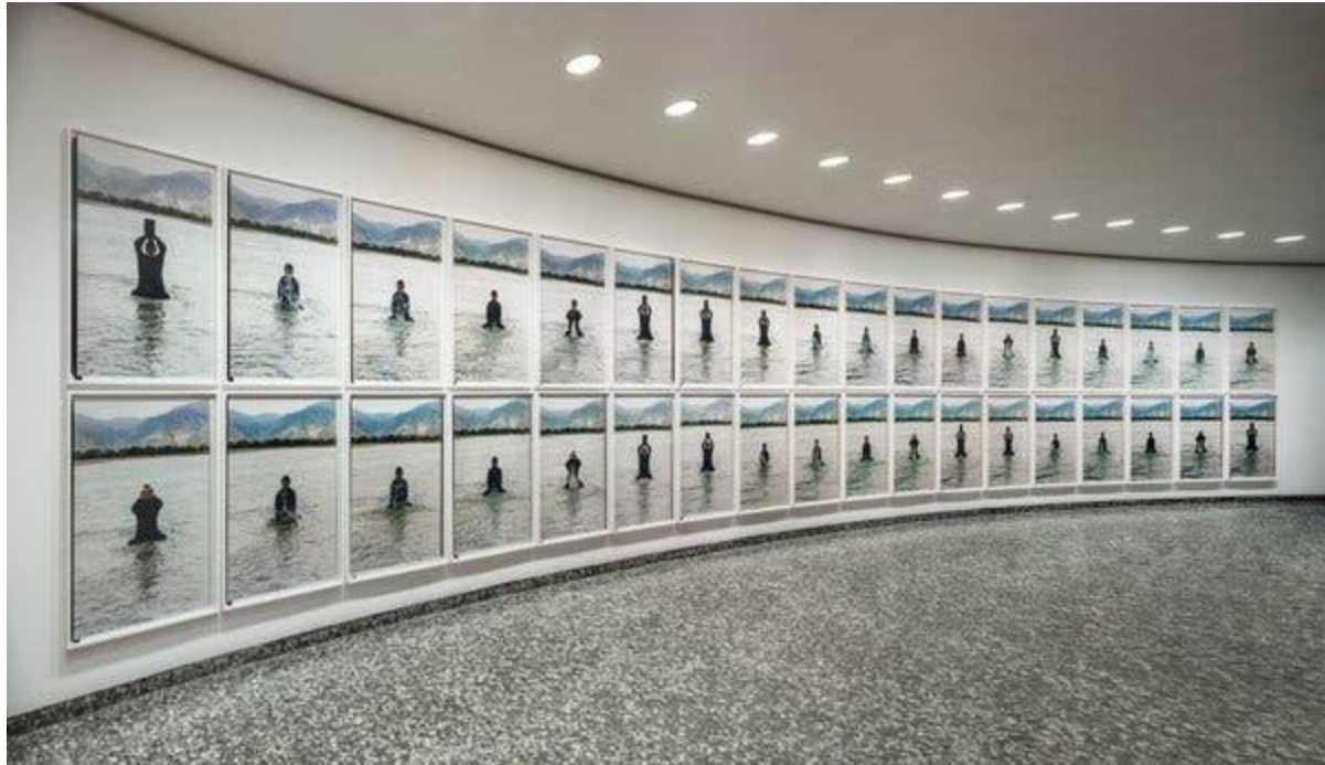
Installation view of Song Dong, “Stamping the Water (Performance in the Lhasa River, Tibet, 1996),” 1996.

Already, the decade of the '90s feels like a heroically quixotic time for Chinese artists working in photography. The exhibition opens with a wall mural of 36 color photographs by Song Dong, “Stamping the Water (Performance in the Lhasa River, Tibet),” 1996, in which (at a time of political tension between Chinese authorities and Tibetan protesters) he repeatedly pressed a large wooden seal, marked with the Chinese character for water, into the river. Of course, his effort left no trace.