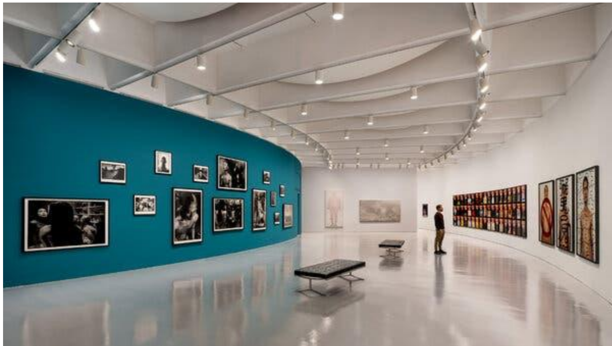
Installation view of “A Window Suddenly Opens: Contemporary Photography in China,” at the Hirshhorn Museum and Sculpture Garden.

Like a hornet trapped in amber, the tumult of those days can be viewed in the exhibition “A Window Suddenly Opens: Contemporary Photography in China,” at the Hirshhorn Museum and Sculpture Garden, through Jan. 7. (After May 7, it will be displayed in a slightly abridged version.) The 186 works in the show — from this era, with a handful of more recent exceptions — are mostly drawn from the collection of Larry Warsh, who has promised 141 of them to the museum.