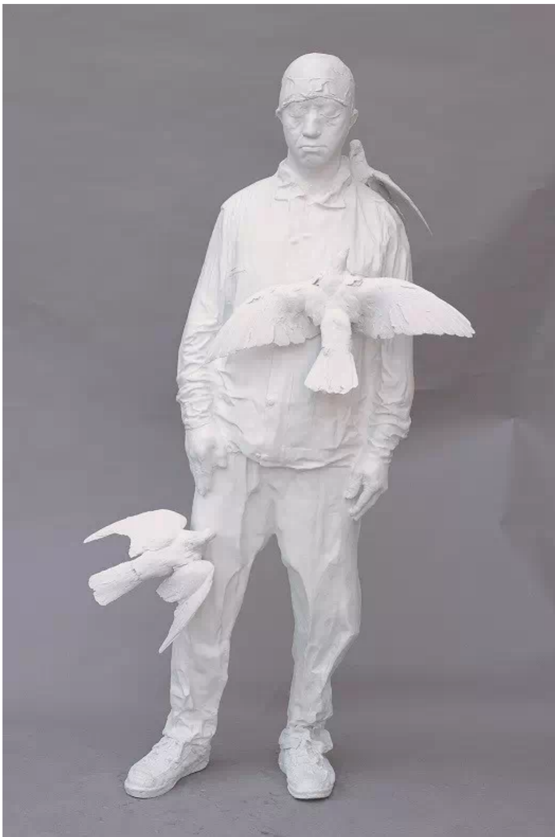
Zhang Dali. Square No.1. 2014. Sculptures. Fiberglass and Baking Varnish. 170x100x85cm

張大力的作品被以下機構收藏：現代藝術博物館（美國紐約）；國際攝影中心（美國紐約）；亞洲協會（美國紐約）；丹佛藝術博物館（美國科羅拉多）；21c博物館（美國肯德基）；Saatchi畫廊（英國倫敦）；福岡亞洲藝術博物館（日本）；Smart博物館（美國芝加哥）；杜克大學Nasher博物館（美國北卡羅萊納州）。