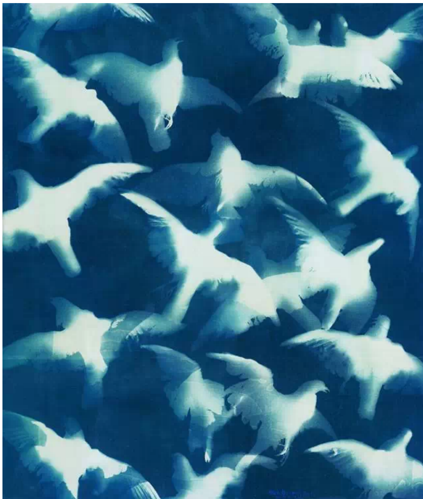
Zhang Dali. Blue Sky9. 2014. Cyanotype and Oil On Canvas. 145x125cm

品以及人物雕塑。張大力是中國最出名的塗鴉藝術家。2006年之後，他不再進行塗鴉的行爲，因爲塗鴉已普遍被公衆接受，變成了時髦和時尚。他轉而進行更多種的藝術形式和媒介，比如攝影，藍曬成像，用樹脂及玻璃纖維澆注的真人大小雕塑。在北京及亞洲各地的城市中，經濟和政治因素迫使人們從傳統的低層房屋遷入鋼筋水泥的高層公寓。包括張大力在內的許多藝術家都在用藝術記錄這一重大的社會轉型，表達他們的憤怒和關切。