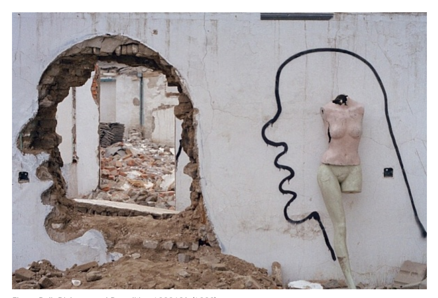
Zhang Dali, Dialogue and Demolition 199968A (1999)