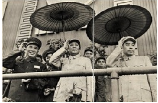
Zhang Dali, 1952 the First Sport Meeting of the National Army

In the 1990s, he created graffiti under the pseudonym AK47 lamenting the demolition of ancient Beijing by drawing outlines or carving images of his own bald head onto condemned Hutong walls. His series Chinese Offspring in the 2000s, grotesquely realistic sculptures of migrant laborers often dangling from the ceiling like hanged men, expanded his focus on the human condition in Chinese cities. His paintings that superimpose government slogans on top of Cultural Revolution and Tiananmen Square imagery and his Second History project that presents doctored propaganda photos next to their originals has hardly endeared him to officials, prompting yet more shuttered exhibitions. But he continues to show in China frequently, albeit carefully.