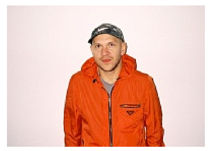
Karilampi's Absolut speakeasy open for business in Stockholm