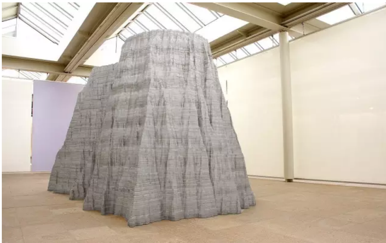
18 may 2016 - 5march 2017 安尼斯·卡普尔 (Anish Kapoor) 山 (Mountain)