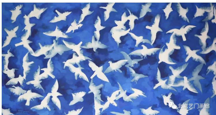
Zhang Dali 张大力 (b. 1963, 哈尔滨, 中国), 蓝色天空, 布面油画、蓝晒, 220x 410 cm, 2016

张大力坚持以研究为本的创作。他的工作室在北京郊区，每天都要与这个城市和郊区的空间相遇，到处都是荒废的等待再度开发的空地。他的创作目标 - 无论是涂鸦还是蓝晒亦或雕塑 - 都始终保持一致：立即接触，观察，呈现对现实日常发生的直接印象。艺术家利用蓝晒的阴影主体和全身塑像塑造出一个迅速消失的街头生活：记录了快速消失的街头生活，描绘了城市“幸存者” - 无论是超现实主义人类还是其他生物的不朽的本性 - 他坚定地记录着城市的变化并追溯遗迹。