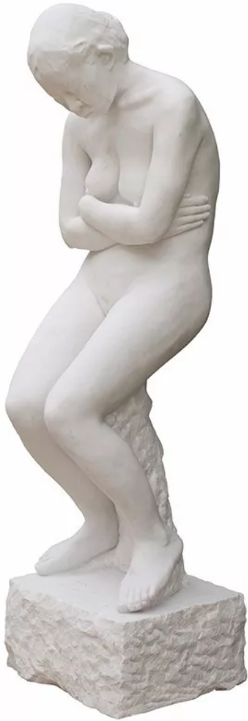
Zhang Dali | 张大力 Sculpture, White Marble, 146 X 40 x 46 cm, 2016